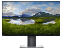
DELL ULTRASHARP 24 MONITOR - U2419H

23.8" ultrathin bezel optimized for dual display productivity. Easy Arrange feature enables multitasking efficiency and its small base frees valuable workspace.