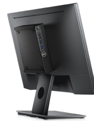
OPTIPLEX MICRO ALL-IN-ONE MOUNT FOR DELL E SERIES MONITORS

Small footprint mounting solution adapts to your environment, with cable management and monitor height adjustability, tilt, swivel and pivot functions.