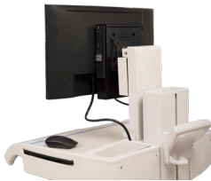
OPTIPLEX MICRO DUAL VESA MOUNT

This mount allows the Micro to be VESA mounted to select Dell E Series displays.