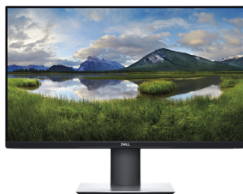
DELL 24 MONITOR - P2419H

23.8" ultrathin bezel optimized for dual display productivity. Easy Arrange feature enables multitasking efficiency and its small base frees valuable workspace.