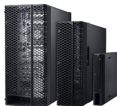
OPTIPLEX CABLE COVERS

Communicate clearly with a headset optimized to provide in-person sound quality, certified for Microsoft Skype for Business.