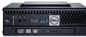
OPTIPLEX MICRO DVD+/-RW ENCLOSURE

Mount your system between two VESA compatible devices. Includes an adapter box to securely house the system's power adapter.