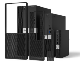
OPTIPLEX DUST FILTERS

Thermally tested custom cable covers offer an easy to install and attractive way to manage cables and secure ports.