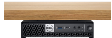
OPTIPLEX MICRO VESA MOUNT

Mount your system on a wall or under a surface with full optical drive access. Includes an adapter box to securely house the system's power adapter.