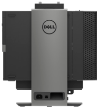
OPTIPLEX SMALL FORM FACTOR ALL-IN-ONE STAND

Small footprint mounting solution featuring integrated monitor power and Ethernet cables, as well as monitor adjustability with height, tilt, swivel and pivot functions.