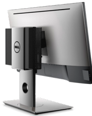
OPTIPLEX MICRO ALL-IN-ONE STAND

Small footprint mounting solution featuring integrated monitor power and Ethernet cables, as well as monitor adjustability with height, tilt, swivel and pivot functions.